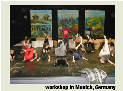
workshop in Munich, Germany