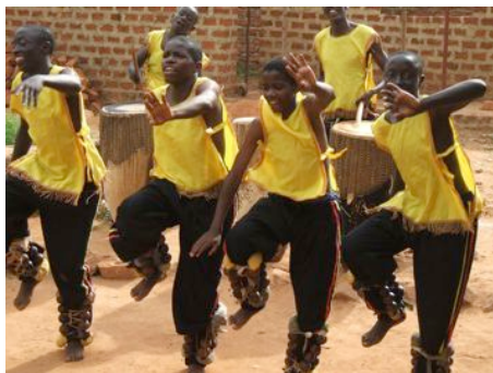
the boys rehearsing