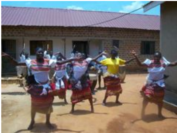
Rehearsing in the compound of the project