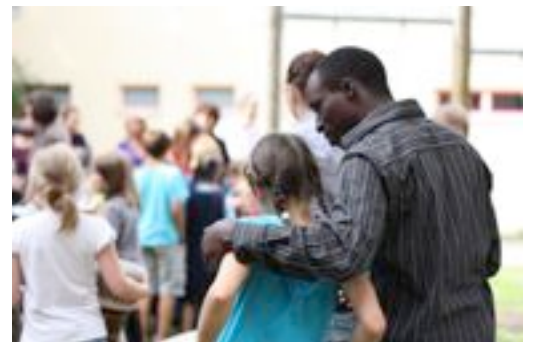
workshop Munich, Germany