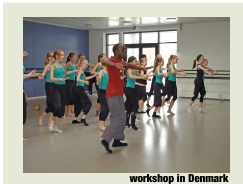
workshop in Denmark

All our partner schools in Uganda where our children go, for all their academic corporation and support to the children so as