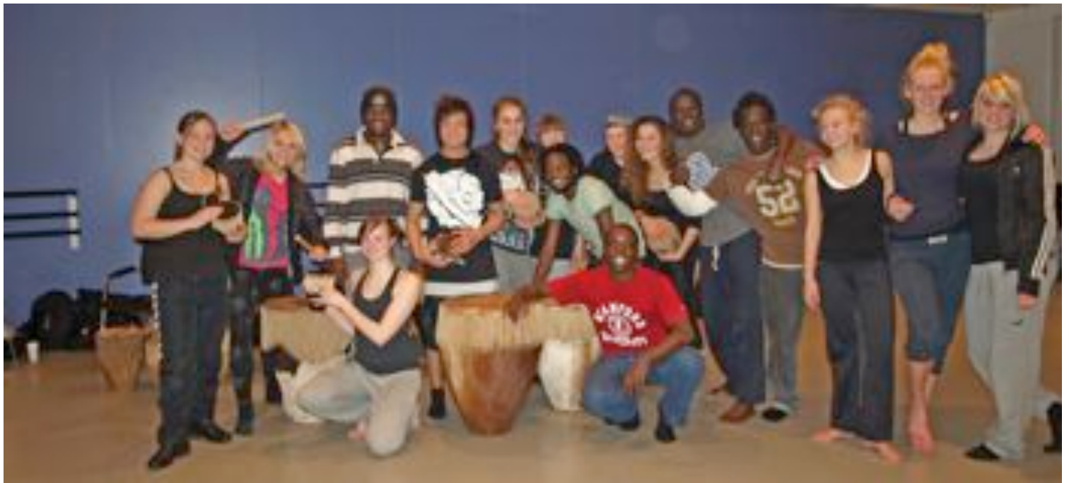
workshop in Denmark