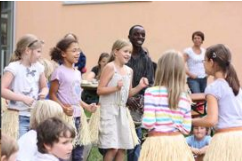
workshop in Munich, Germany